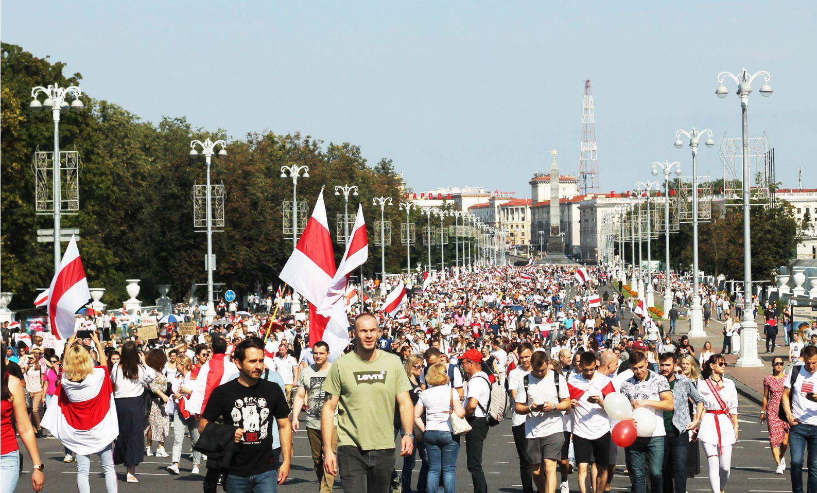
Protests in Minsk, Belarus

Belarusian authorities should cease the harassment of lawyers defending human rights and human rights defenders and fulfil their obligations under the UN Basic Principles.